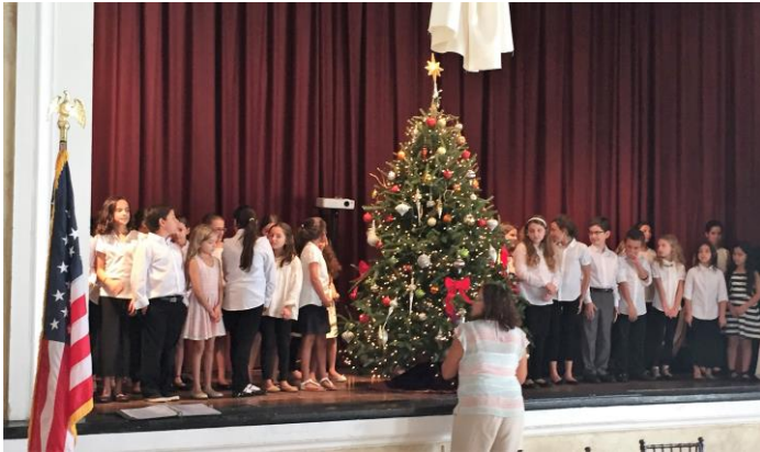
The Children Choir from Riviera School entertaining us with Christmas Carols